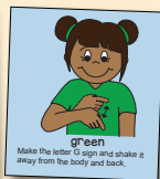
green Make the letter G sign and shake it away from the body and back.