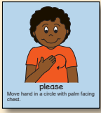
please Move hand in a circle with palm facing chest.