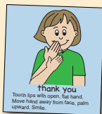
thank you Touch lips with open, flat hand. Move hand away from face, palm upward. Smile.