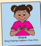
more Bring fingertips together a few times.